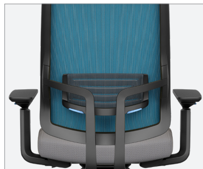
Integrated lumbar with modernized Y-support