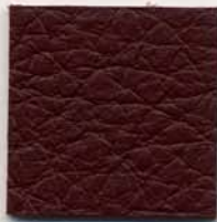
VR 908 Claret