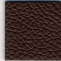
VO 980 American Gothic