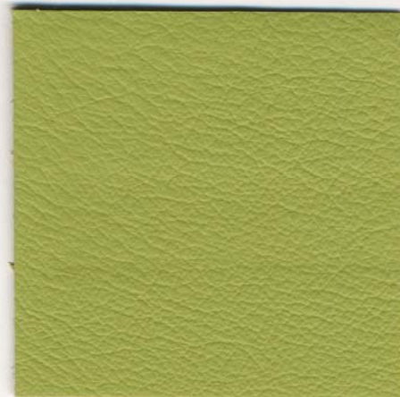
VP 520 Persian Lime

Spinneybeck Andes/Velluto Pelle An additional 120 colors are available in this quality.