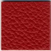
VO 982 Kilim