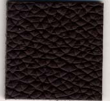
VO 947 Coffee Bean