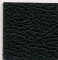
VR 910 Thicket