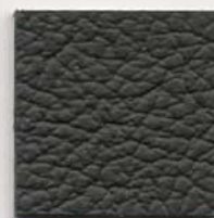
VR 946 Dark Grey