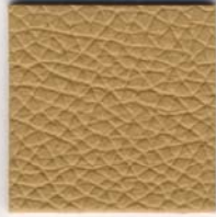
VO 901 Butterscotch