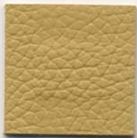
VR 979 Butter