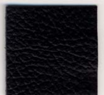
VO 900 Black