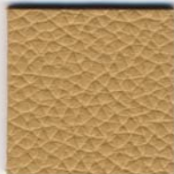
VO 944 Sand