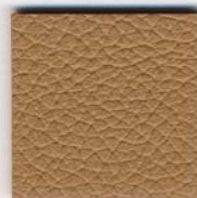
VO 940 Doeskin