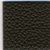
VO 968 Fumo Oscuro