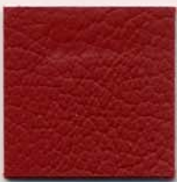
VR 2010 Ruby