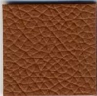
VO 945 Tan