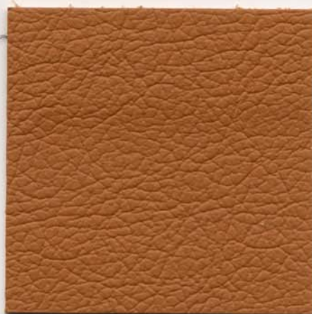
VR 8029 Caramel

For the complete Spinneybeck collection, please refer to the Commercial Price List.