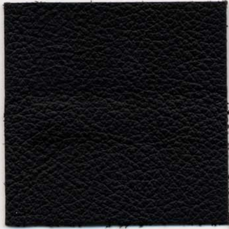
801 Rally Black