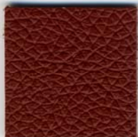
VO 963 Tuscany