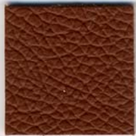
VO 903 Toast