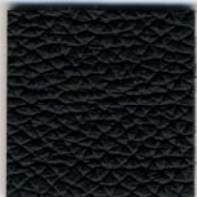
VO 910 Laurel