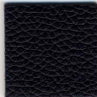
VO 973 Ocean Deep