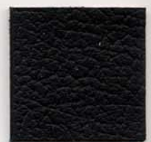
VR 900 Black