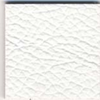
VO 785 White