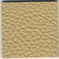
VO 939 Talc