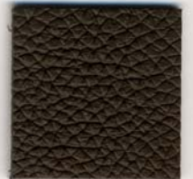
VO 967 Deep Olive