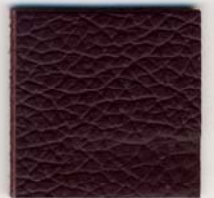
VO 937 Claret