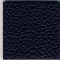
VO 955 Marine Blue