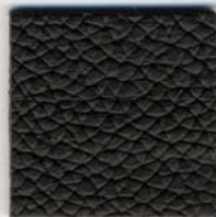
VO 969 Mammoth Cave