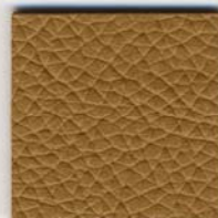
VO 965 Shaker Ochre