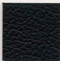
VR 906 Midnight