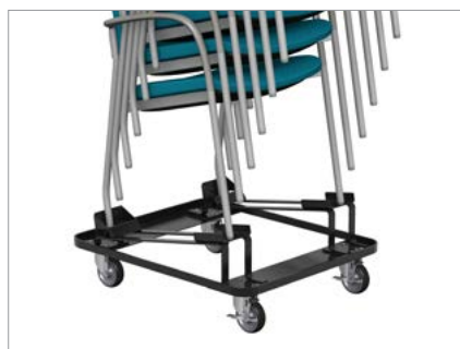
Stacking cart offers extra space and convenience