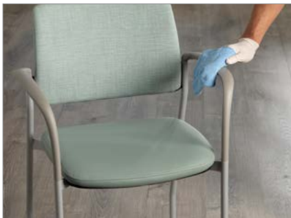
Easy to clean for safer sitting