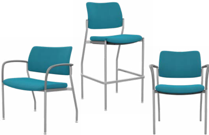
Midsize (600 lb)*