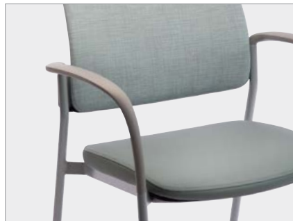
Multi-upholstery expands design possibilities