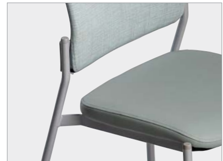
Armless option available on guest