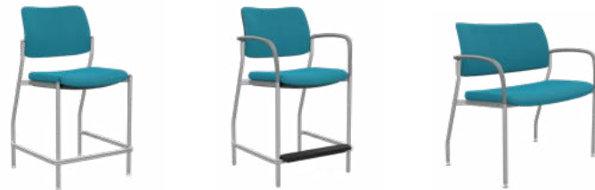
Counter Stool (500 lb)*