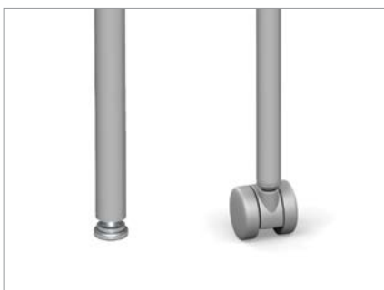
Available with casters or glides