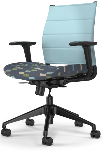
Wit Thintex Midback

Thintex textiles are bright and vibrant. They're durable, cleanable and available in both fabric and vinyl. For the design layer, specifiers can choose between two SitOnlt Collection carded textiles in the same 12 colors as the Wit mesh back chair: