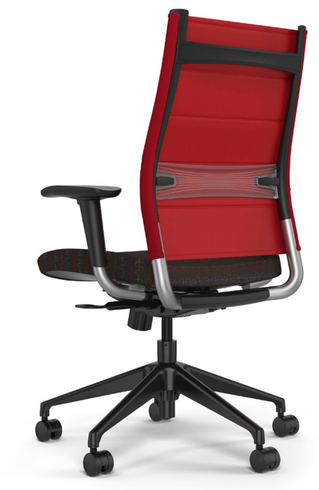
Wit Thintex Highback