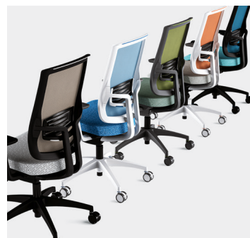
19 mesh colors to coordinate with any space