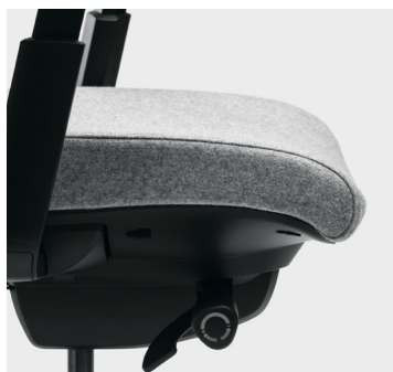
Ergo-curve seat with intuitive mechanism