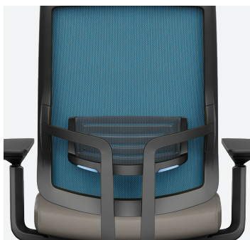
Lumbar support included on mesh back