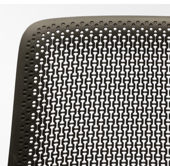
Precision-engineered polymer back