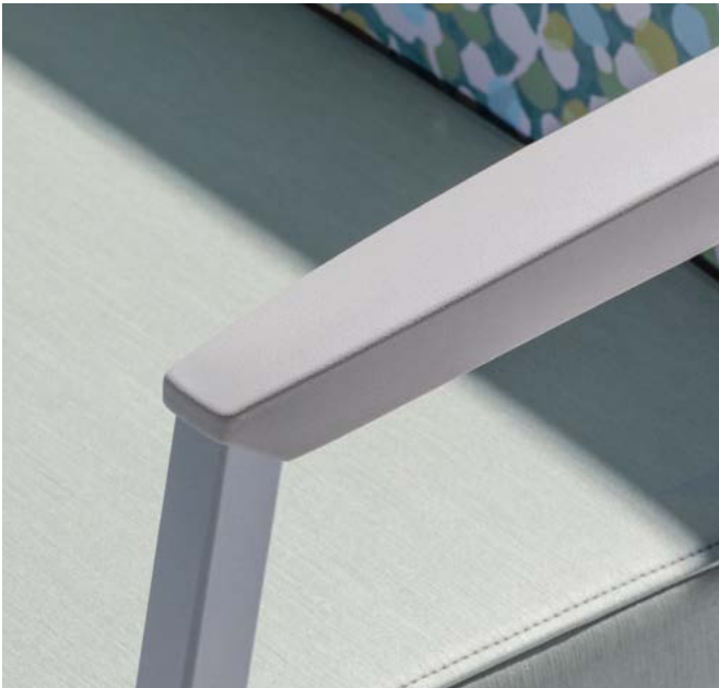
Glass-filled nylon arm cap

Discreet clean-out, glass-filled nylon arm caps, optional underside splash guard and more means this collection stands up to high use and heavy cleaning protocols. Field-replaceable parts keep Kindl up and running with minimal interruptions.