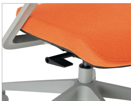
Weight-activated with seat slider