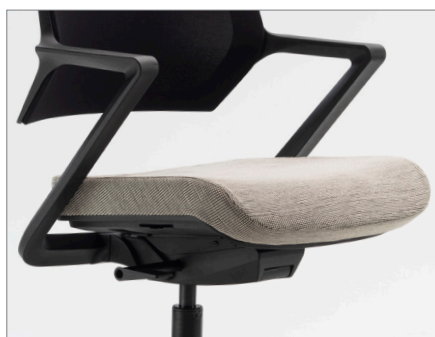
8-hour cushion on streamlined mechanism