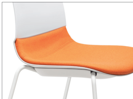
2/3 upholstered seat for enhanced comfort