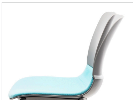
Flex-ridge back moves with you