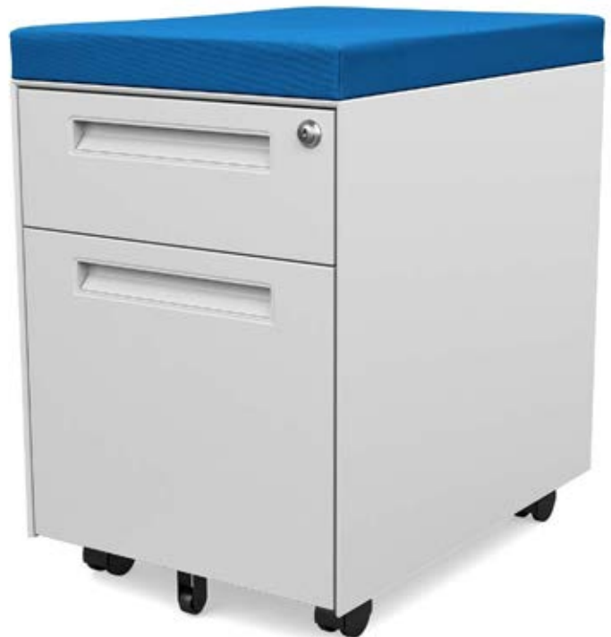
Mobile Pedestal With Upholstered Pad

Our two-drawer mobile pedestal stores everything you need and can move out of the way while still being within reach.