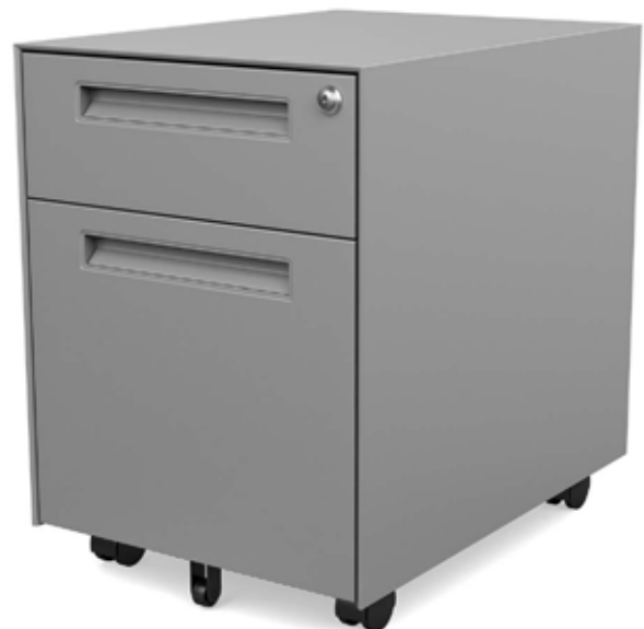
Mobile Pedestal With No Upholstered Pad