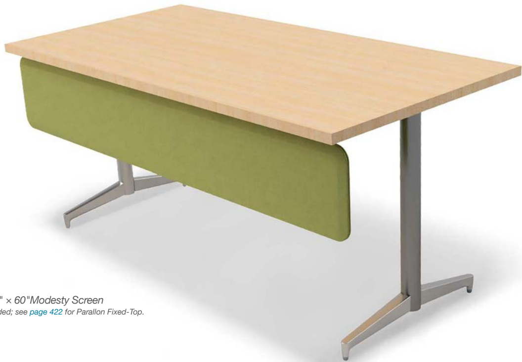
10" x 60" Modesty Screen Table not included; see page 422 for Parallon Fixed-Top.

Fashion spaces that are as focused on privacy as they are on design. Our collection of fabric modesty screens come in a variety of color and size options, letting you create environments that are perfectly cohesive and coordinated.