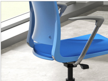
Clean-out space for easy clean-ups