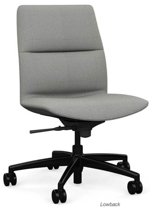
Featured with SitOnIt Seating's Dash — Dove

Please reference the Textile Reference Guide for pricing on fabric over grade 7 and leather over grade 3.