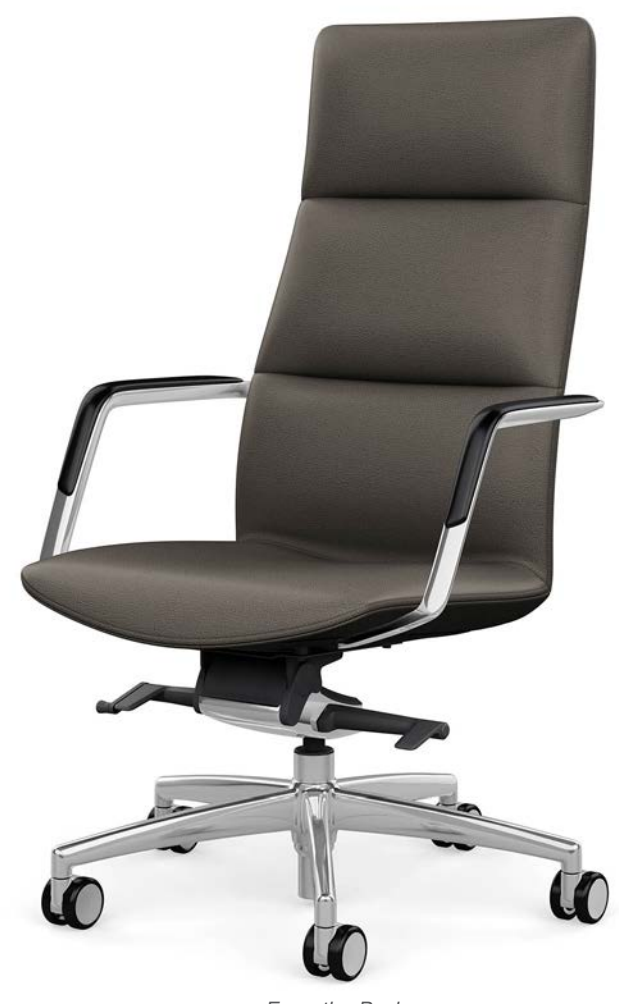
Executive Back Featured with SitOnlt Seating's Rally — Thunder