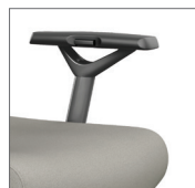
Silver: Fully Adjustable (Six-Way)