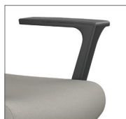
Black or Silver: Fixed Open Loop