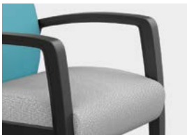
High-density foam with waterfall edge