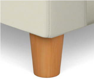
Wood Tapered Cylinder