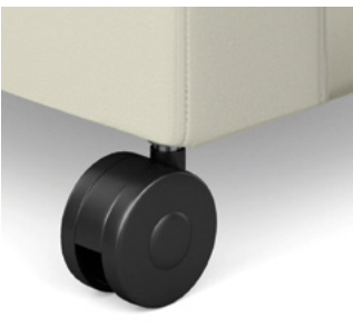
Non-Locking Caster, Black