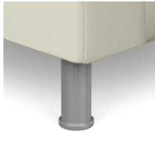
Metal 1.5" Pole, Silver Powder Coat