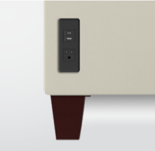
Power (black, silver)