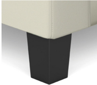
Standard Plastic, Black