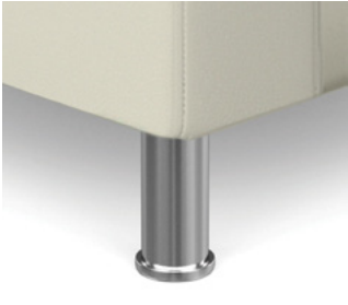
Metal 1.5" Pole, Brushed Aluminum