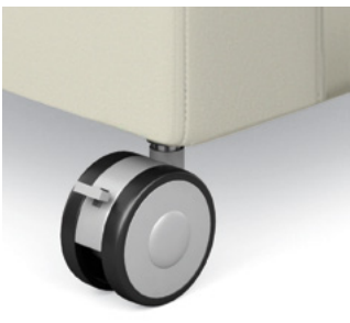
Silver (Non-locking + Locking)