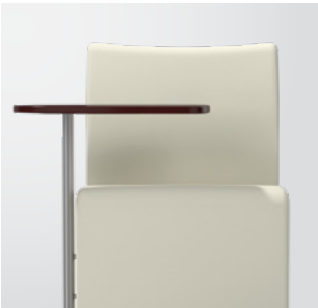
Tablet Arm (black, silver)